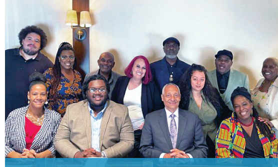
Community Voices Academy Cohort I Graduates

Looking ahead, the Community Voices Working Group is now the Community Voices Academy (CVA). CNHED launched applications for the CVA in summer 2023 and received an overwhelmina response, resulting in 160 applications — a 950% increase from the year prior. The CVA officially began in fall 2023 with 16 new residents. The second cohort is looking forward to hosting CNHED's first Resident Summit post-COVID and to engaging in a robust and eventful budget advocacy season, featuring our annual rally, advocacy day, testimony workshops, and more in 2024.